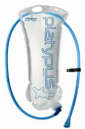
Platypus Hoser 1.8L